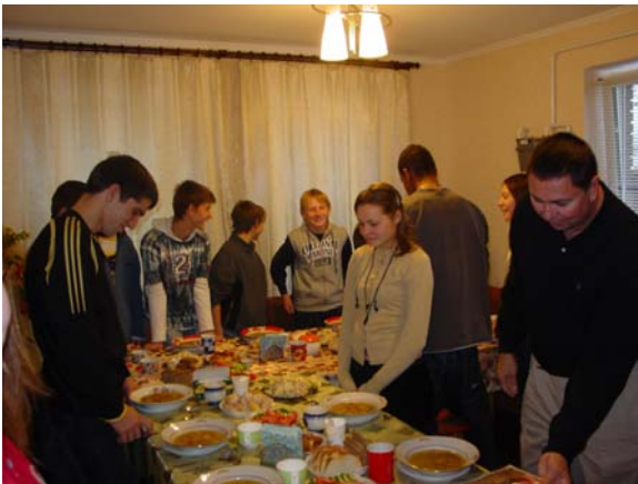
Lunch at Life International Transition Home