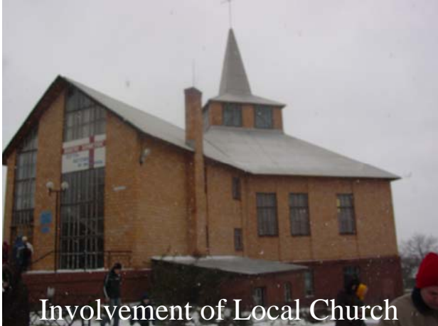
Involvement of Local Church

The concept of Life International is to provide a continuing Christian witness to the children in the Ukrainian orphanages. This Ukrainian program is working through the local Ukraine Baptist churches and is dramatically impacting several orphanages. Computer learning centers, farm projects, gymnasiums, and many programs are provided to the orphanages all enabled by combined US and Ukrainian support. Mission Team Inc may have opportunities to partner with Life International to support and enable teams for camps and activities to benefit the children.