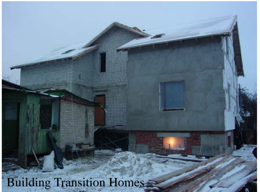
Building Transition Homes