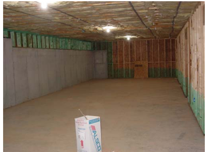
Here is the "before shot" of the basement. If the Lord will bless the work, framing and sheet rock will be going up in a few days.