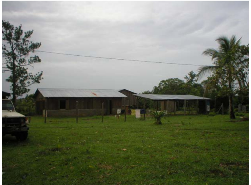
Santa Marta is a beautiful little village on the main road between Puerto Cabaza and Wasparam.