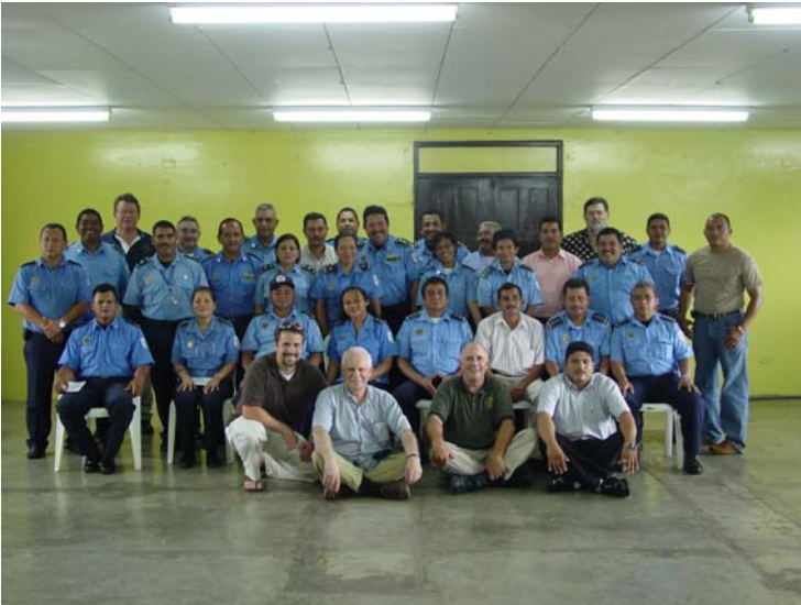
This group is from the city of Chinandega

There is no disputing the fact that when you enter the cities of Leon, Chinandega, and Matagalpa you have crossed many cultural barriers of language and culture, but when you enter the police station in one of these cities and try to begin to build relationships there are a whole new set of cultural barriers that deal with the badge and the uniform. A formidable task yet there is no doubt that the Lord orchestrated this task because of the smoothness and the success.