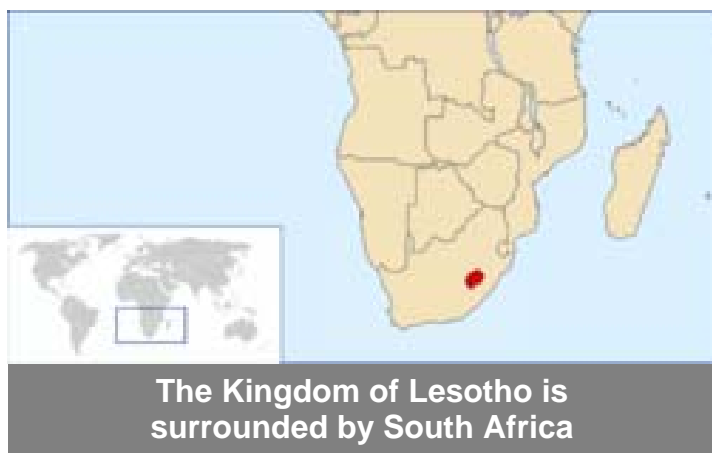
The Kingdom of Lesotho is surrounded by South Africa